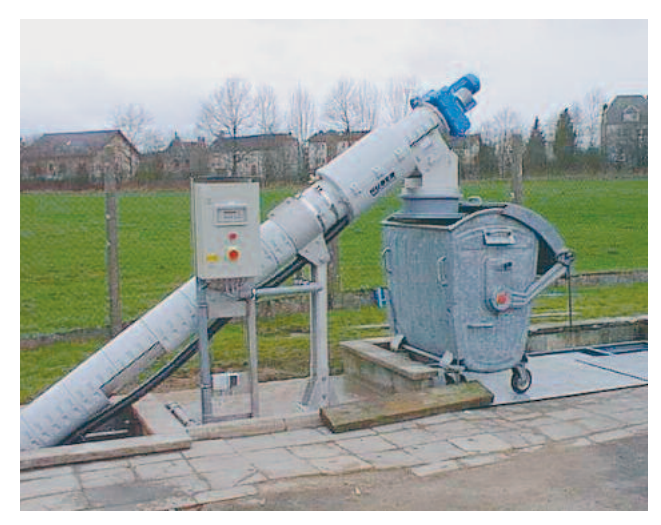
Outdoor installation of a ROTAMAT® Fine Screen Ro 1 with frost-protection