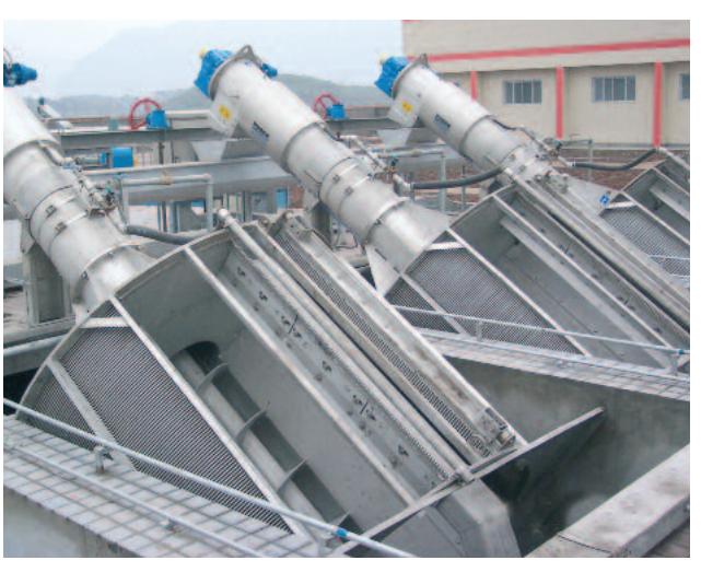
Several parallel ROTAMAT® Fine Screens installed in the channel