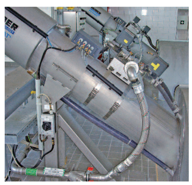
ROTAMAT® Fine Screen Ro 1 with integrated Screenings Washing System IRGA installed in the channel