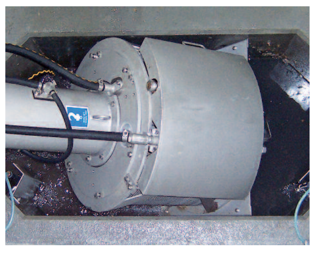
ROTAMAT® Fine Screen with splash guard