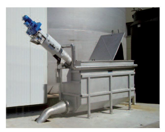
ROTAMAT® Fine Screen Ro 1 in a tank