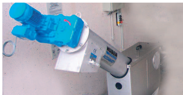
Tank-mounted ROTAMAT® Micro Strainer Ro 9Ec