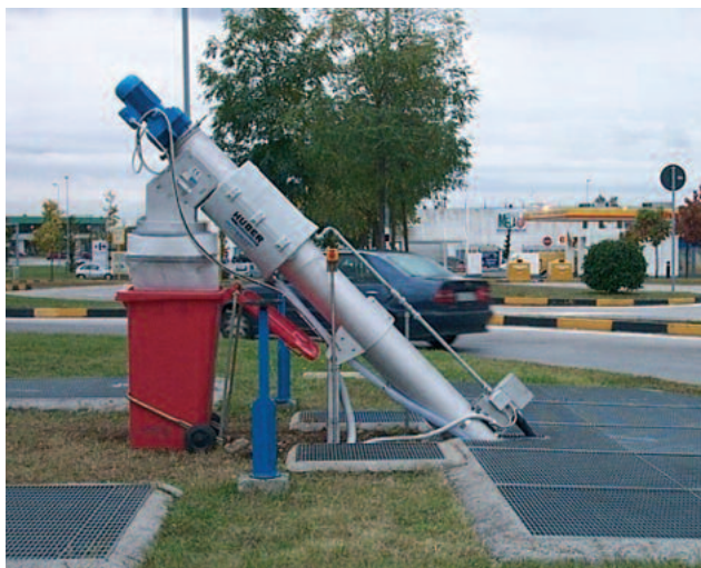
ROTAMAT® Micro Strainer Ro 9 installed in the middle of a roundabout