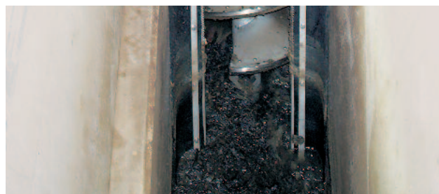
ROTAMAT® Micro Strainer Ro 9 XL with lower maintenance-free ceramic bearing