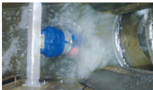
External screenings washing system (ERGA). A preceding washing system washes out the organic matter.