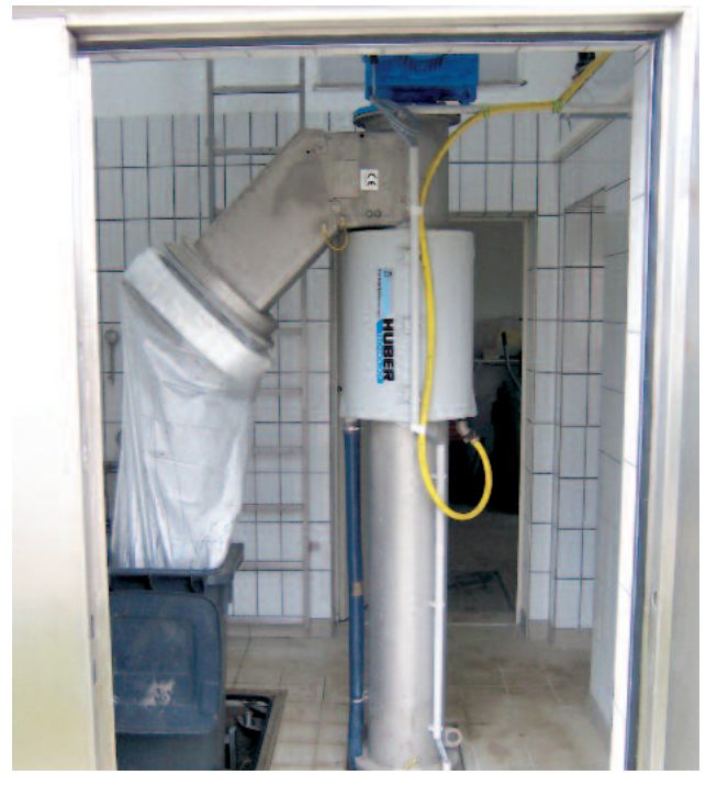
Screenings discharge into a bagger for odour-free disposal