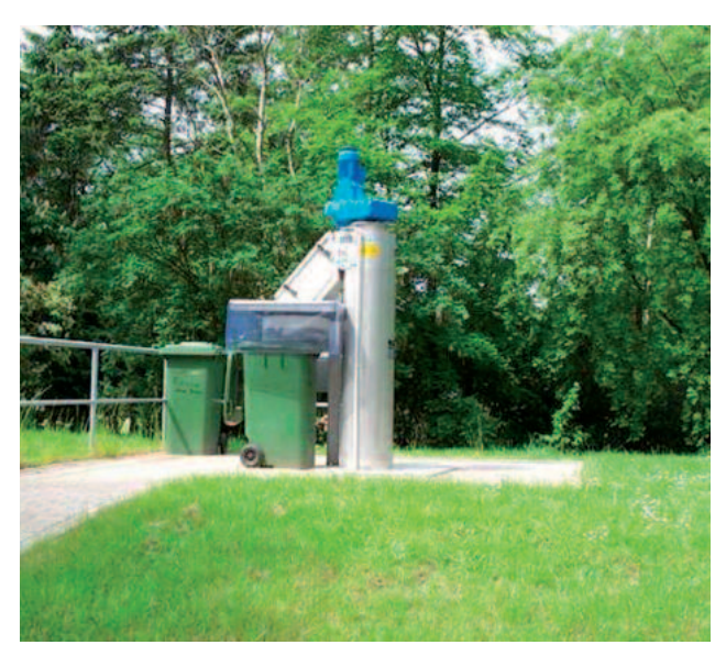
Frost protected outdoor installation

A selection of installation examples will convince you of the ROTAMAT® Pumping Stations Screen RoK 4.