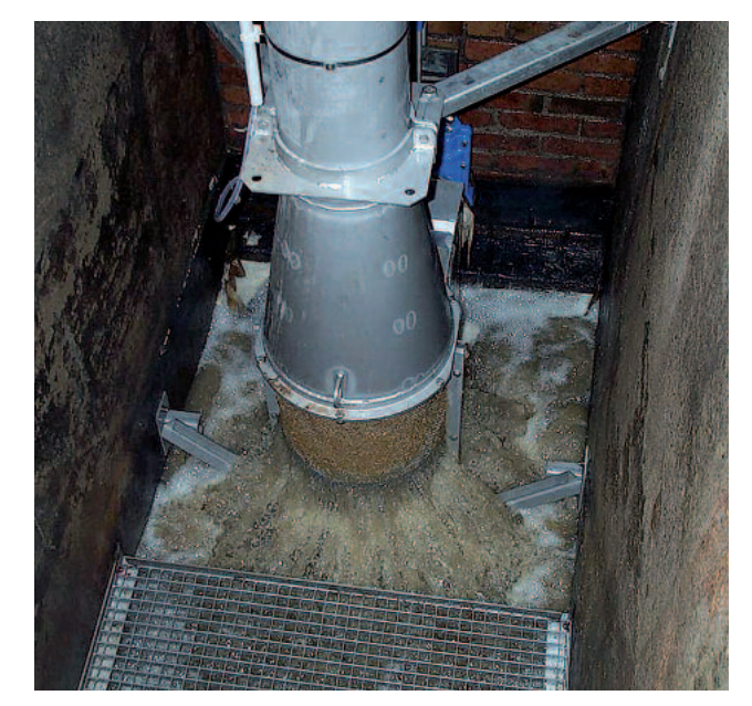
ROTAMAT® Pumping Stations Screen RoK 4 in operation