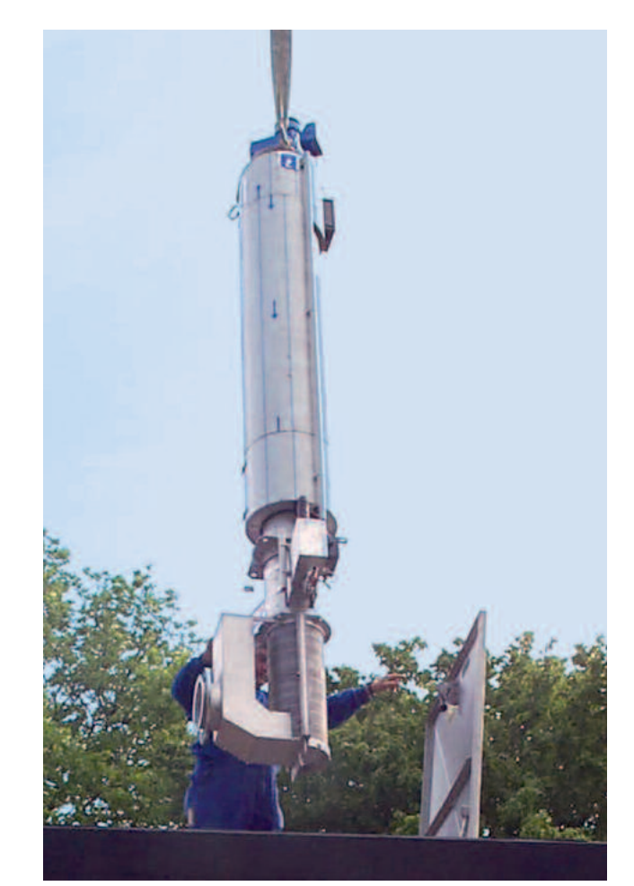
ROTAMAT<sup>®</sup> Pumping Stations Screen RoK 4 being lifted into a pumping station