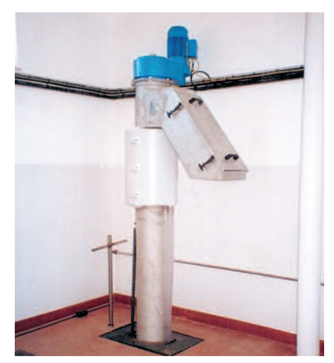
Indoor installation on a small footprint

Industriepark Erasbach A1 · D-92334 Berching Phone: + 49 - 8462 - 201 - 0 · Fax: + 49 - 8462 - 201 - 810 info@huber.de · Internet: www.huber.de