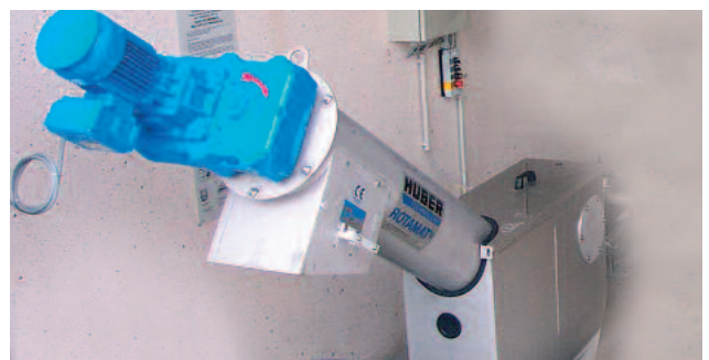
Tank-mounted ROTAMAT® Micro Strainer Ro 9Ec