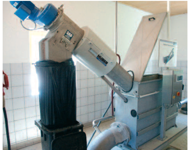
Tank installation of a ROTAMAT® Micro Strainer Ro 9