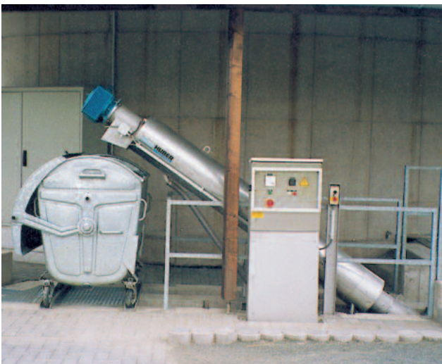
Outdoor installation of a ROTAMAT® Micro Strainer Ro 9