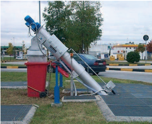
ROTAMAT® Micro Strainer Ro 9 installed in the middle of a roundabout