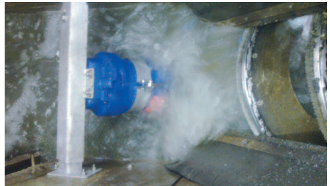
External screenings washing system (ERGA). A preceding washing system washes out the organic matter.