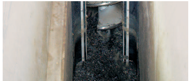
ROTAMAT® Micro Strainer Ro 9 XL with lower maintenance-free ceramic bearing