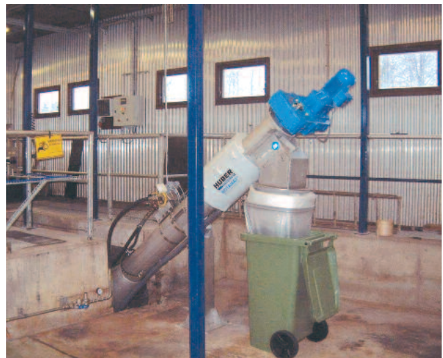
ROTAMAT® Micro Strainer Ro 9 size 700 installed in the channel