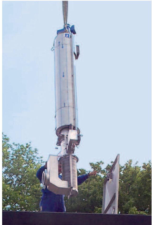
ROTAMAT® Pumping Stations Screen RoK 4 being lifted into a pumping station