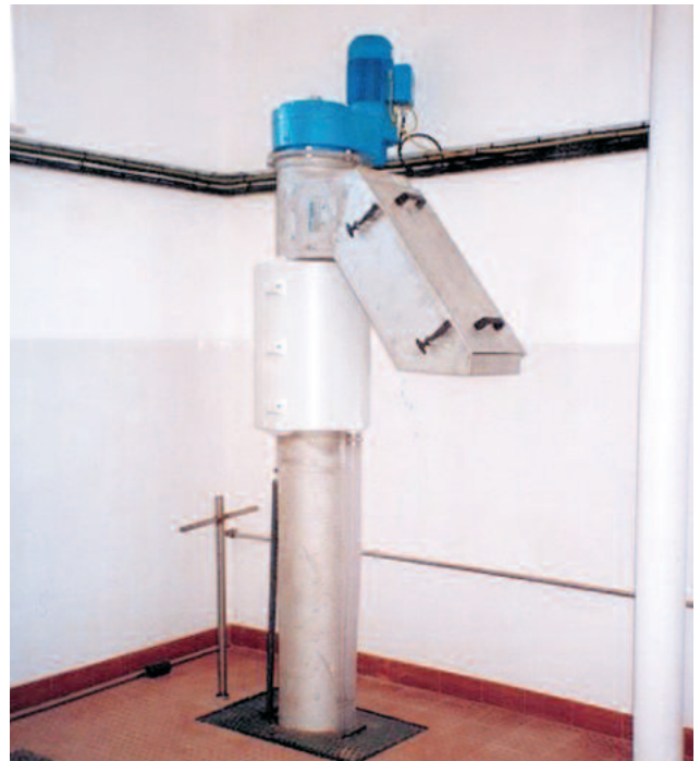
Indoor installation on a small footprint