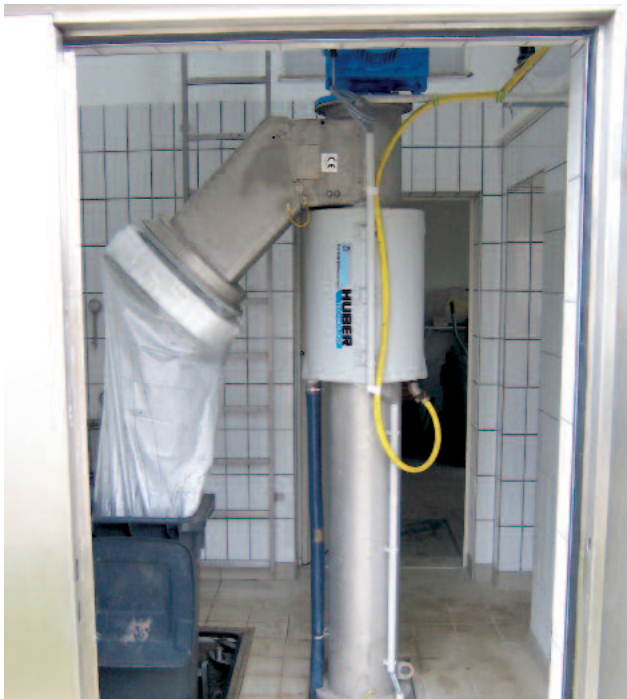
Screenings discharge into a bagger for odour-free disposal