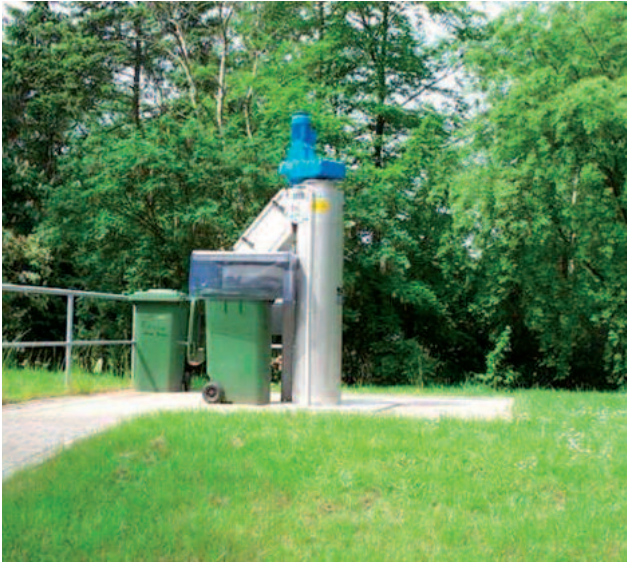
Frost protected outdoor installation

A selection of installation examples will convince you of the ROTAMAT® Pumping Stations Screen RoK 4.