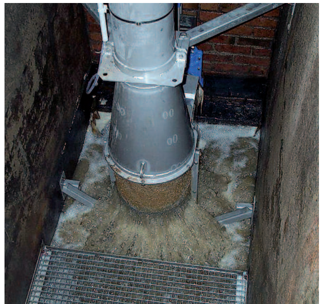
ROTAMAT® Pumping Stations Screen RoK 4 in operation