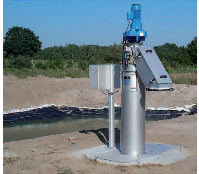
Installation upstream of a pond plant