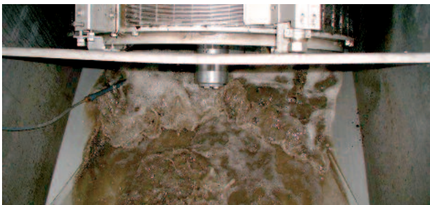
Well-proven wastewater fine screen: ROTAMAT® Rotary Drum Fine Screen Ro 2

Other separation sizes can be supplied on demand. Separate brochures are available for these screens and the WAP.