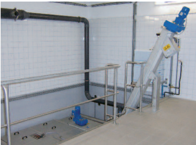
Integrated grit washing at the end of the ROTAMAT® Complete Plant Ro5