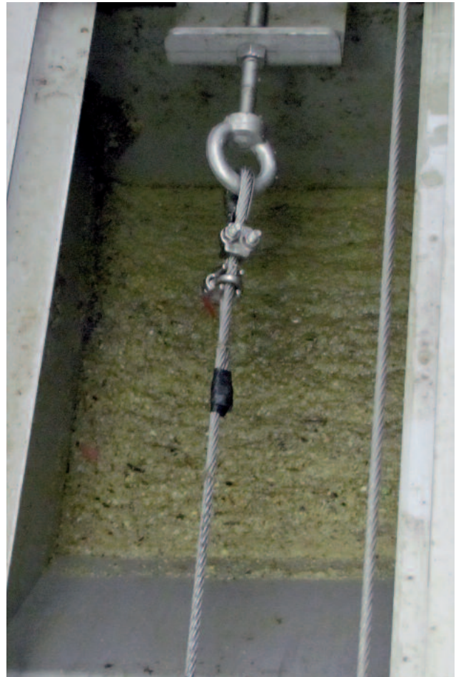
Paddle scraper for grease removal from the grease trap. According to the principle of a longitudinal grit removal scraper the grease paddle pushes the floating fat and grease into the pump sump.

In contrast to many competitors, the floating fats and oils are skimmed off the water surface with a paddle scraper that is slowly pulled with a stainless steel rope. The paddle is shaped so that it removes virtually all floating matter from the grease trap. Anaerobic degradation of fat and grease, and there-with odor nuisance, is thus prevented.