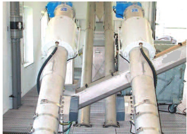
Underground, redundant ROTAMAT® Complete Plant Ro5