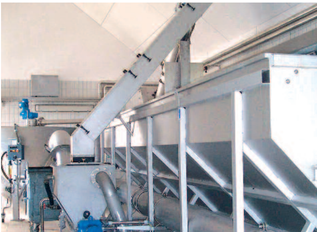
Intensive washing of screenings in a WAP/SL Wash Press subsequent to a ROTAMAT® Complete Plant Ro 5