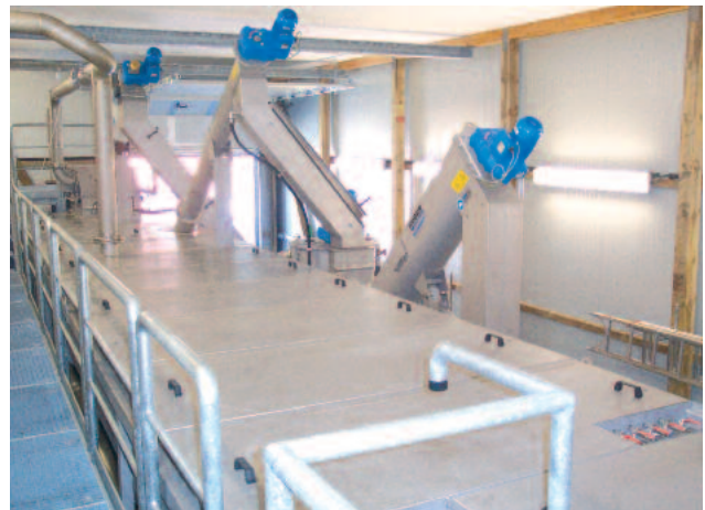
Odor-encased screenings discharge from the ROTAMAT® Complete Plant Ro5