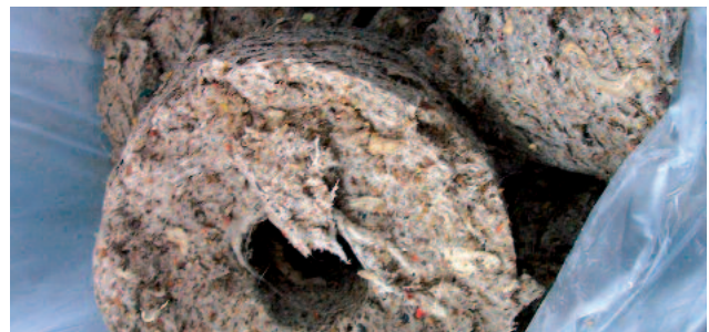
Washed and compacted screenings – the ideal fuel

Solids concentration of screenings, depending on the WAP type used: Up to 50 % DS.