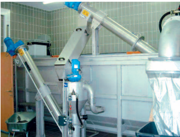
Classifying screw with subsequent Grit Washer RoSF 4/tC

The classified grit slides from the upper end of the inclined screw into a Grit Washer RoSF 4/t.